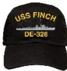
Washed Cotton Polo Cap Ship Design Item # CL215-SH $24.99 One Size Fits All