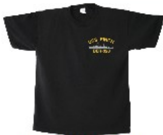
Cotton Pique Preshrunk T-shirt Ship Design Item # CL305-SH S-XL: $25.99; XXL: $28.99 3XL: $30.99; 4XL: $32.99

When ordering, please be sure to include your ship information: USS Finch DE-328, USS Finch DER-328, OR USCGC Finch WDE-428.