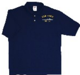
Cotton Pique Preshrunk Polo Shirt Ship Design Item # CL315-SH S-XL: $35.99 XXL: $39.99; 3XL: $43.99

Some of our most popular items are pictured below. Additional colors, sizes and styles available at www.soldiercity.com/RW .