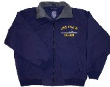
3 Season Nylon Weatherproof Jacket Ship Design Item # CL550-SH S-XL: $74.99 XXL: $78.99; 3XL: $82.99

When ordering, please be sure to include your ship information: USS Finch DE-328, USS Finch DER-328, OR USCGC Finch WDE-428.