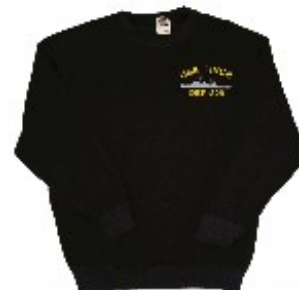
Heavyweight Fleece Sweatshirt Ship Design Item # CL310-SH S-XL: $33.99 XXL: $37.99; 3XL: $41.99