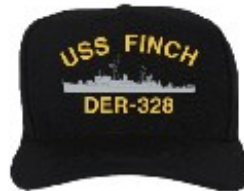
5 Panel Wool Cap Ship Design Item # CL230-SH $29.99 One Size Fits All